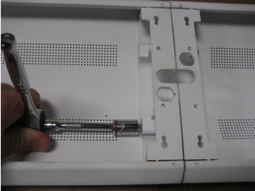
Step 4: Finished Product