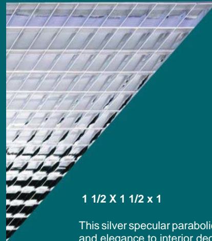
1 1/2 X 1 1/2 x 1

This silver specular parabolic louver adds atmosphere and elegance to interior decor.