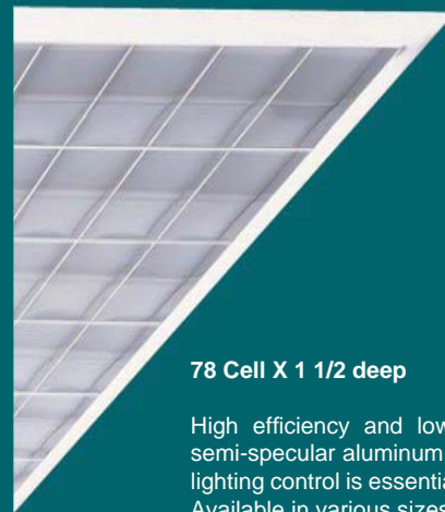
78 Cell X 1 1/2 deep

High efficiency and low maintenance make this semi-specular aluminum louver a must where good lighting control is essential and rigid fire codes exist. Available in various sizes.