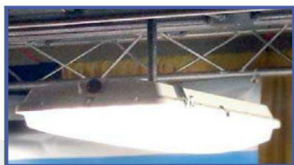
Accessory available for 3/4" Hub for single point mounting

H203 Stainless Mounting Strap H199 Zinc Plated Mounting Strap