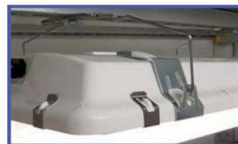
Stainless hardware for mounting straps and latches

Dimensions and specifications subject to change without notice.