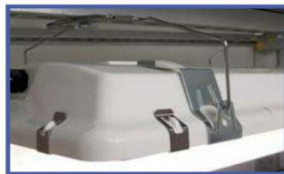
Stainless hardware for mounting straps and latches

Dimensions and specifications subject to change without notice.