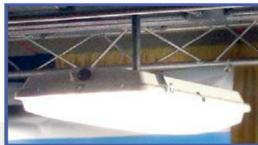
Accessory available for 3/4" Hub for single point mounting