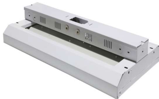
DLC Premium HBP24-LED105FRDMV50

Dimensions and specifications subject to change without notice.