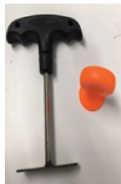
Lens Tool (AIOCLENSTOOL)

Dimensions and specifications subject to change without notice.