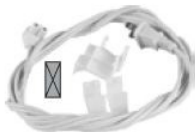
DED/6 - JOIN 6 in. cord to join fixture to fixture

Dimensions and specifications subject to change without notice.